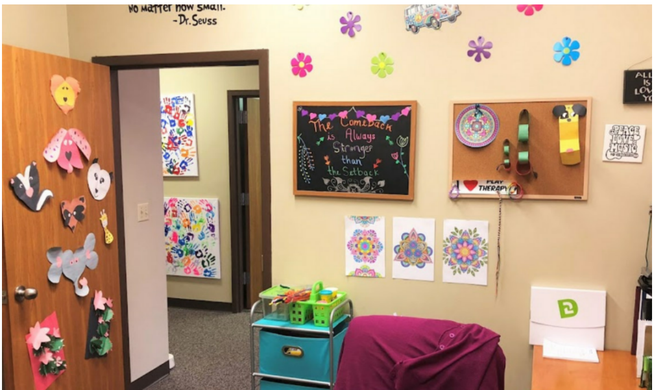
Child and Family Therapist Office