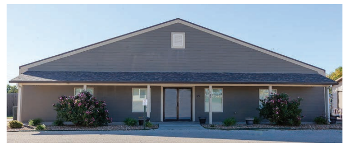
Truman Lake Center (TLC) 109 Wesmor Street Clinton, Missouri 64735

For Information or to make an appointment, please call: